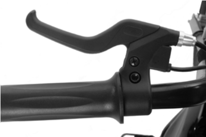
REAR BRAKE LEVER