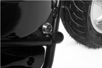
BATTERY CHARGING PORT