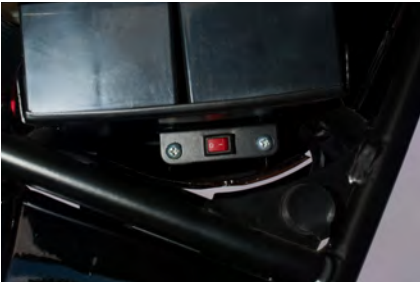
SAFETY SPEED LIMITER SWITCH