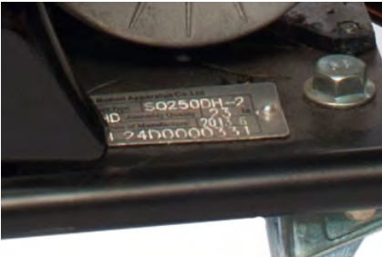
VEHICLE IDENTIFICATION NUMBER (ETCHED INTO METAL PLATE ON BOTTOM OF MINI BIKE)